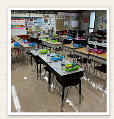
A Peek into Grade 6