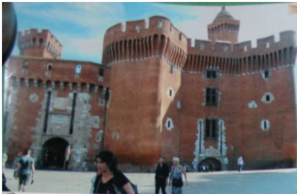
The next town we visited was Perpignan, it has walls all around the old part this is the main gate to go into that part of town