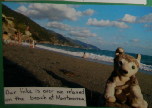
Our hike is over we relaxed on the beach at Monterossa.