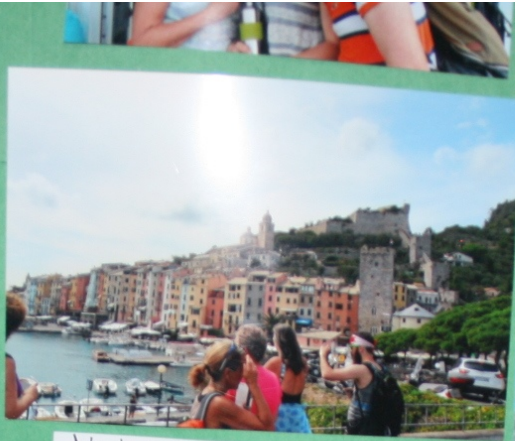
We took the bus to Porto Venere to go for a swim and saw 2 weddings