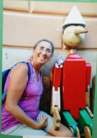
We met Pinocchio