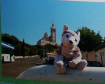
This tank sits just down the hill from the church in memory of the French soldiers who fought to free France from the German army