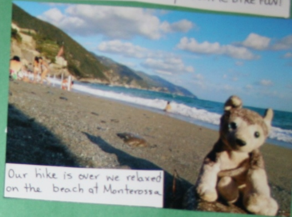
Our hike is over we relaxed on the beach at Monterossa