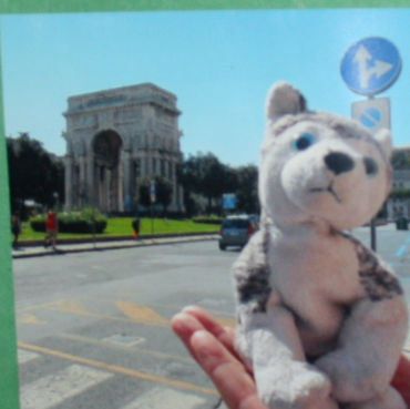
We changed trains in Genoa so went and ate lunch in the Piazza de la Victoria, this is a war monument that we sat near