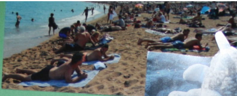
On the beach in Barcelona