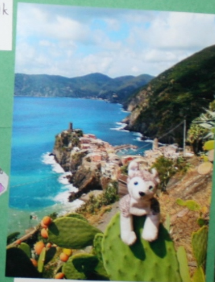
I am sitting on a cactus just above the town of Vernazza on the 1st part of the hike We climbed to the top of the tower you see in the town