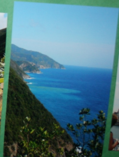
Our view as we hiked the Blue Trail! Beautiful