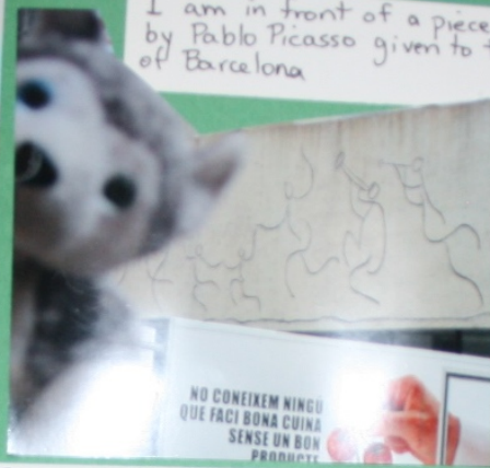
I am in front of a piece of art by Pablo Picasso given to the people of Barcelona