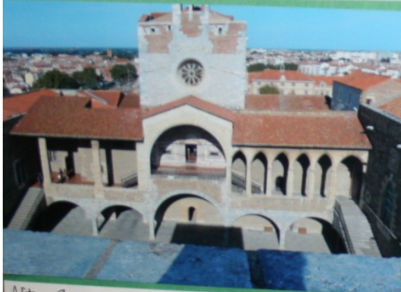
This was the castle in Perpignan, we got to walk all through it. It was really neat.