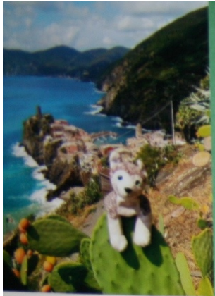
I am sitting on a cactus just above the town of Vernazza on the 1st part of the hike. We climbed to the top of the tower you see in the town.