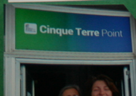
Getting tickets for the Cinque Terre hike It was incredible