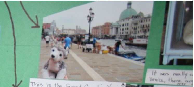
This is the Grand Canal in Venice