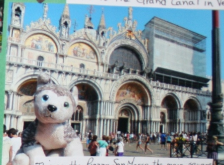
This is the Piazza San Marco the main square in Venice. I am in front of St Mark's Church