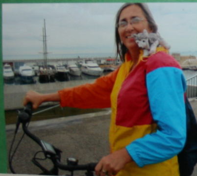
We toured Barcelona by electric bike FW!