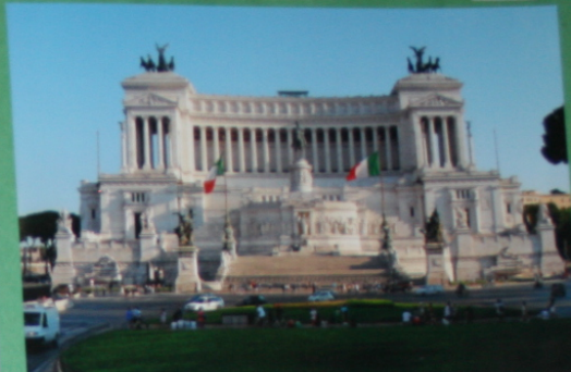
We walked on Capitoline Hill, saw the monument to Italy's 1st king