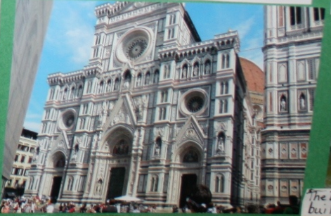
The Duomo is Florence's cathedral built in the 13th century