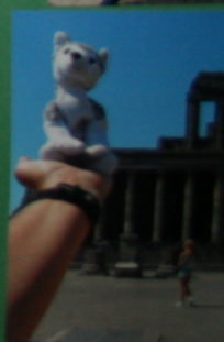
This dog was in ash when Vesuvius erupted.