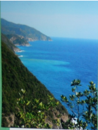
Our view as we hiked the Blue Trail! Beautiful